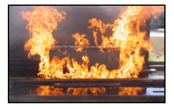
Figure 1: view of tank undergoing fire test

The results presented herein apply only to the test specimen as prepared and as tested. Test equipment used in the performance of this test program was calibrated to standards traceable to the NIST.